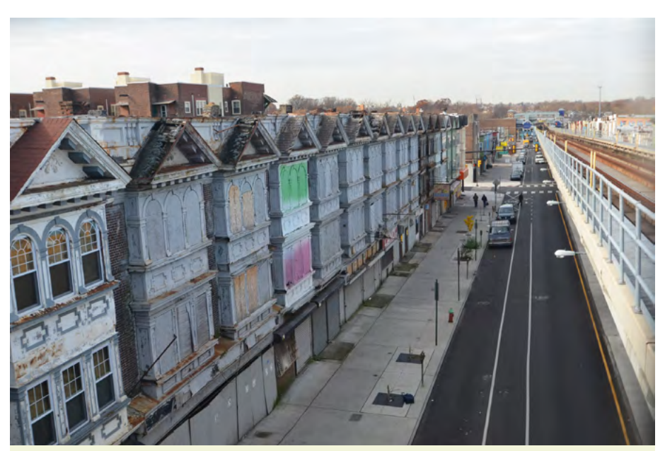
Street tree stumps and boarded-up windows haunt a commercial strip in Philadelphia's Haddington neighborhood.

demographically similar but uninfested neighborhoods. In Kondo's words, "Invasive tree pests like the emerald ash borer may have social costs that are worth considering."