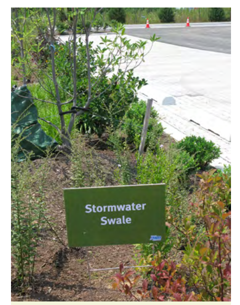
Green stormwater infrastructure projects have been connected with improved quality of life in underserved urban neighborhoods.

One Tree Tenders group, called Philly Tree People, has planted more than 1,000 trees in northeast Philadelphia neighborhoods such as Kensington and Fishtown. Group cofounder Jacelyn Blank says, "I'm a nature person, and I know I feel calmer and more peaceful in a natural environment. There are places where the trees have improved the feel of the neighborhoods, as well as how people feel about living there. It's making a difference."